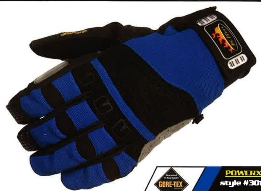
POWERXROSS GLOVE style #3010 Sizes: M-2XL Color: Black / Blue / Red Price: $69.99

The PowerXross is the result of the time and effort spent working with our factory and testing in the field to create a better product. The PowerXross glove is truly the ultimate in light-weight gloves without compromising durability and waterproofness. The PowerXross glove is the answer for those that are looking for a waterproof motocross style glove. The glove is waterproof and breathable which is made possible through the use of Gore-Tex®. Durability is achieved by using a double reinforced synthetic leather palm. Also features such as wrap around fingertips add to the longevity of the gloves.