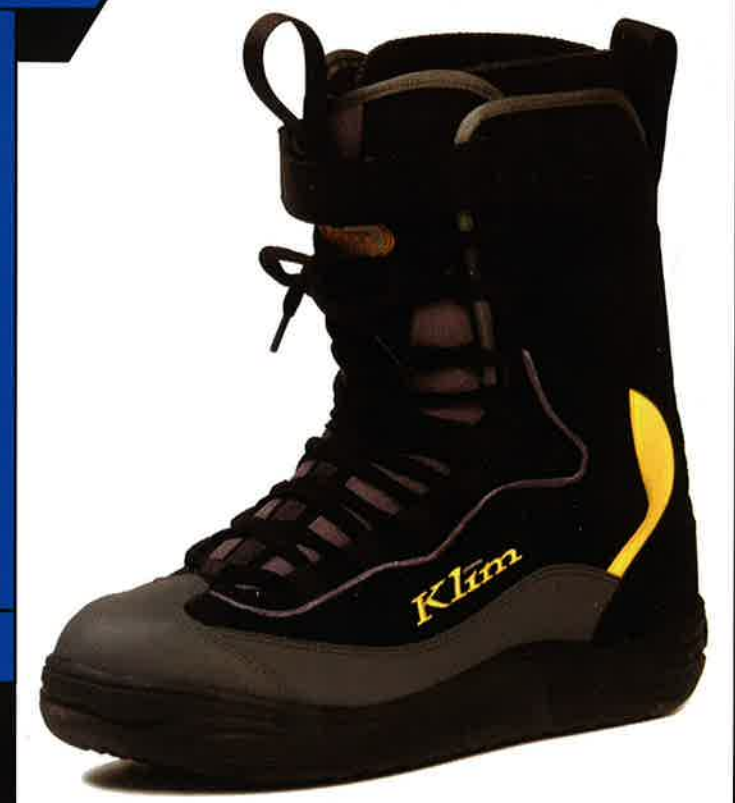
VELOCITY BOOT style #3012 Sizes: Mens 7-14 (Generally worn one size larger than shoe size) Color: Black Price: $146.99

Team Gear bag is the perfect size for carrying all your goodies for a day or two of riding. Measuring 38" long x 16" tall x 14" wide, one end is for boots, the other, a lined helmet bag. The center section will fit your outerwear, a few layering pieces, and room for a few extra's. Easy to carry and priced right too!