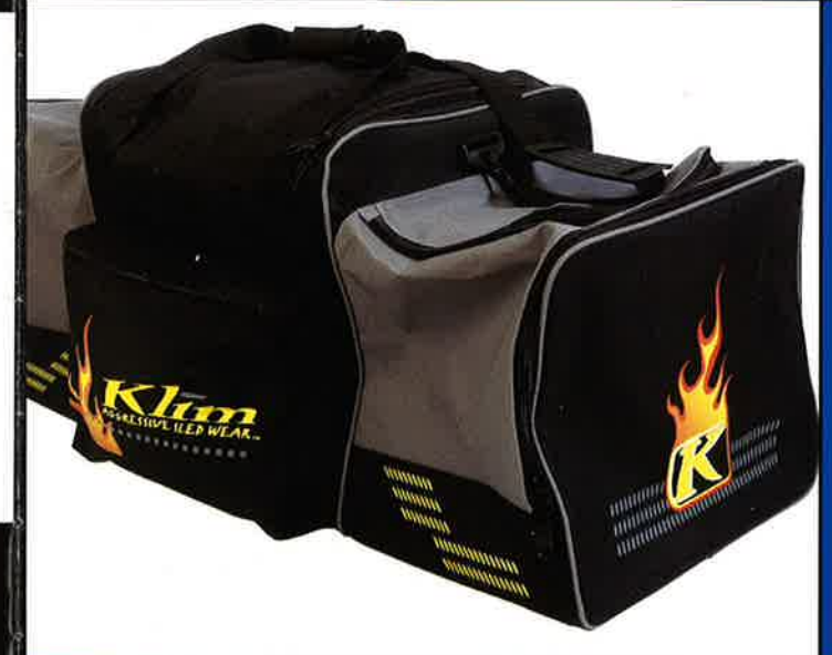
TEAM GEAR BAG style #3013 Sizes: One size Colors: Black Price: $69.99 U.S.

Other qualities that have been taken into account are features such as lightweight, warmth and durability.