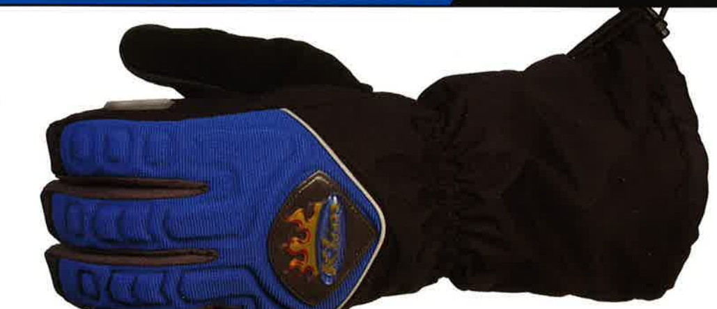
TOGWOTEE GLOVE style #3011 Sizes: M-2XL Color: Black / Blue / Red Price: $69.99

A next generation of glove, the Togwotee glove will gain the respect of all who wear it. Yes, the Togwotee has some of the same features as its predecessor the Detontor, but has been resized and reworked to be the best glove on the market. Aggressive riders will find that the Togwotee glove will be one of the most versatile pieces in their bag.