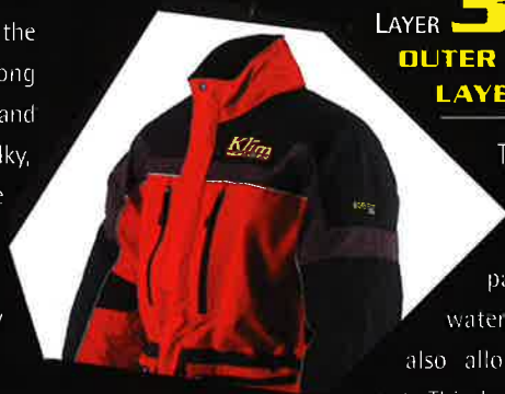
LAYER 3 OUTER LAYER

Our Mid-Weight Line-up consists of our fleece pant, jacket and vest. All three piece provide excellent warmth without the unneeded bulk and are made from synthetic fabrics which will not hold onto moisture.