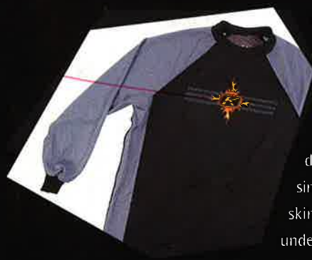
LAYER 1 BASE LAYER

The first layer needs to keep you warm and dry on the inside. And since it's closest to the skin, this means long underwear that's soft and lightweight not itchy or bulky,