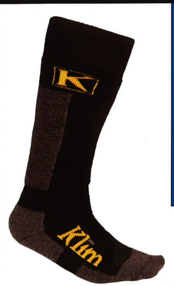
KLIM SOCK style #3018 Sizes: 7-10 (Med.) 11-14 (Lrg.) Price: $19.99 U.S.

The Velocity Boot is like no other boot that you have ridden in. Traditionally snowmobile boots are sloppy fitting; give no support and no added protection. The Velocity Boot is form fitting, gives the foot better support and will give greater protection. That is why you will be amazed at what this boot has to offer.