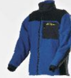
EVEREST JACKET PAGE 34 • No. 3150 KIDS SIZES AVAILABLE