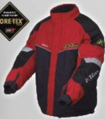
KLIMATE PARKA PAGE 15 • No. 3077 KIDS SIZES AVAILABLE