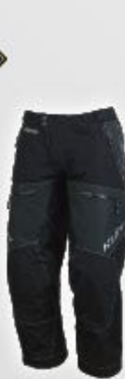
NEW FREE RIDE PANTS PAGE 27 • No. 3373