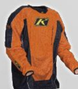
MOJAVE JERSEY PAGE 41 • No. 3009