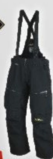
NEW EXTREME BIB PAGE 25 • No. 3275