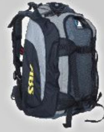
ABS ESCAPE 30 PAGE 54 • No. 4001