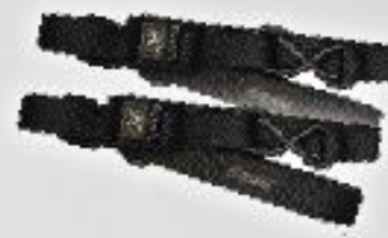
KLIM TIE DOWN PAGE 58 • No. 3002