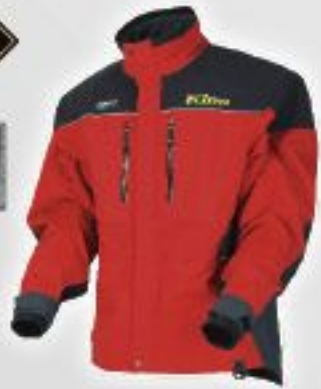
NEW VALDEZ PARKA PAGE 9 • No. 3270