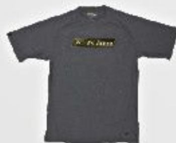
TEAM TECH T PAGE 55 • No. 3223