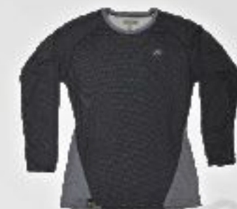
ELEVATION TECH T LS PAGE 56 • No. 6021