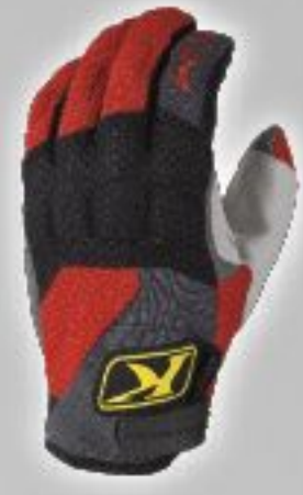
MOJAVE GLOVE PAGE 50 • No. 3068