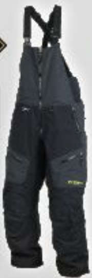
NEW TOGWOTEE BIB PAGE 23 • No. 3274