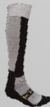
KLIM SOCK PAGE 43 • No. 3118