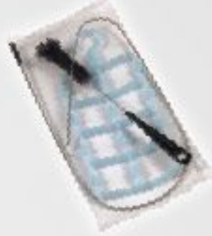
CLEANING KIT PAGE 53 • No. 3000