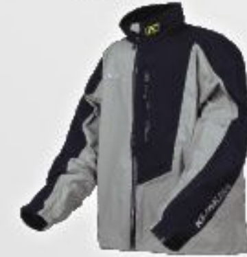
STOW AWAY JACKET PAGE 19 • No. 3048