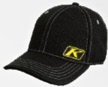
K CORP HAT PAGE 57 • No. 3130 KIDS SIZES AVAILABLE