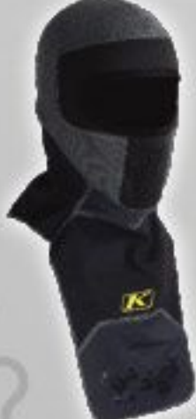
COVERT BALACLAVA PAGE 43 • No. 3085