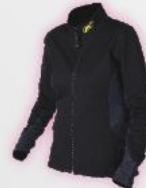
SUNDANCE SHIRT PAGE 38 • No. 3046