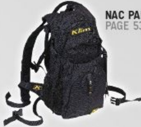
NAC PAK PAGE 53 • No. 3219