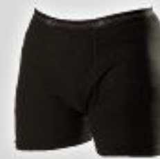
AGGRESSOR BRIEF PAGE 42 • No. 3158