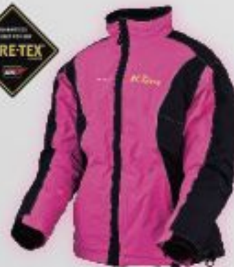
ALLURE PARKA PAGE 31 • No. 3269