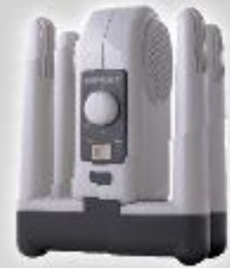
BOOT DRYER PAGE 58 • No. 3001