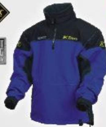
NEW POWERXROSS PULLOVER PAGE 13 • No. 3372