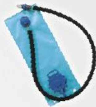
WATER BLADDER PAGE 53 • No. 3099