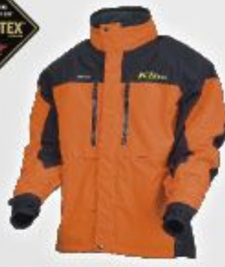
NEW TOMAHAWK PARKA PAGE 11 • No. 3271