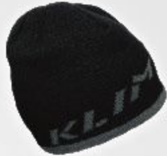
KLIM BEANIE PAGE 57 • No. 3133