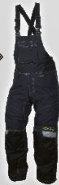
KLIMATE BIB PAGE 29 • No. 3078 KIDS SIZES AVAILABLE