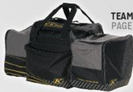
TEAM GEAR BAG PAGE 53 • No. 3213