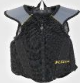
TEKVEST PAGE 52 • No. 3097