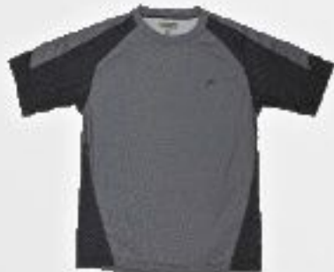
SUMMIT TECH T SS PAGE 55 • No. 6010