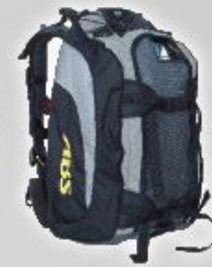
ABS ESCAPE 15 PAGE 54 • No. 4002