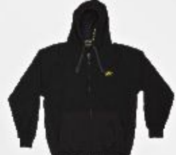
TEAM TECH HOODY PAGE 55 • No. 3220