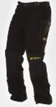
EVEREST PANT PAGE 35 • No. 3153 KIDS SIZES AVAILABLE