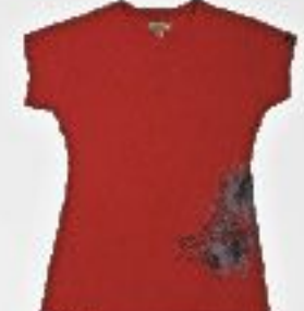
LADY TECH T PAGE 56 • No. 3225