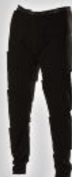
AGGRESSOR PANT PAGE 42 • No. 3157