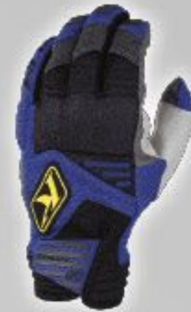
DAKAR GLOVE PAGE 50 • No. 3067