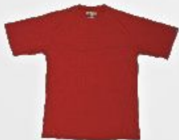
K CORP TECH T PAGE 55 • No. 6000