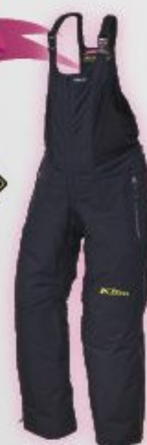
ALLURE BIB PAGE 33 • No. 3276