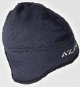
RUBICON BEANIE PAGE 57 • No. 3134