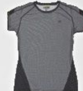
ELEVATION TECH T SS PAGE 56 • No. 6020