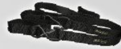
KLIM TOW STRAP PAGE 58 • No. 3003