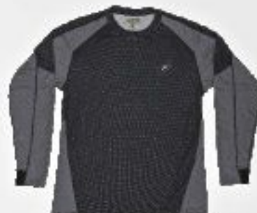
SUMMIT TECH T LS PAGE 55 • No. 6011