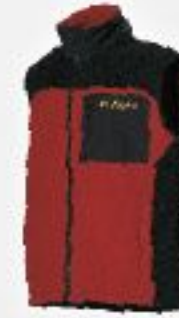
EVEREST VEST PAGE 34 • No. 3151