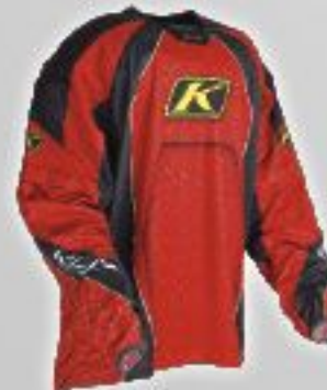
REVOLT JERSEY PAGE 40 • No. 3315