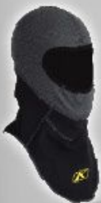
KLIM BALACLAVA PAGE 43 • No. 3116

[MADE TO WICK MOISTURE AWAY FROM THE SKIN]