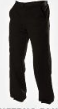
INFERNO PANT PAGE 37 • No. 3155