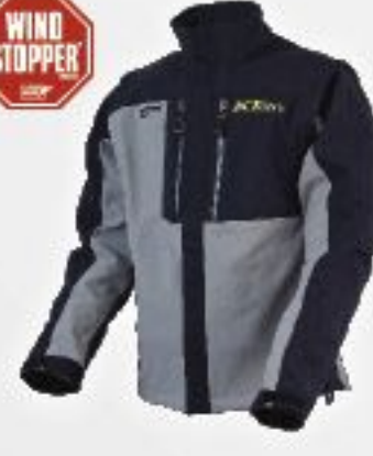
INVERSION JACKET PAGE 17 • No. 3249