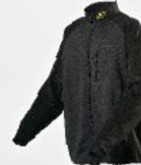
INFERNO SHIRT PAGE 36 • No. 3154