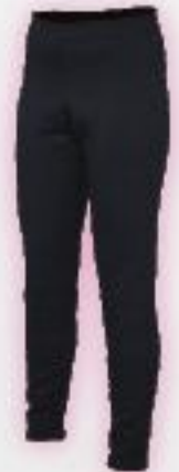
SUNDANCE PANT PAGE 39 • No. 3047