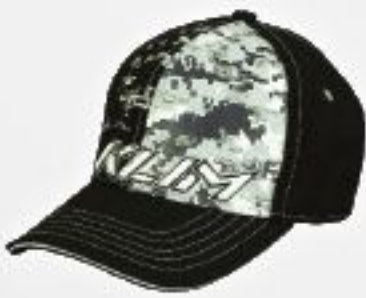
EDGE FLEX HAT PAGE 57 • No. 3131