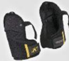
SHOULDER PADS PAGE 52 • No. 3098