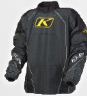
REVOLT PULLOVER PAGE 21 • No. 3214