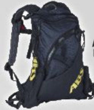
ABS FREERIDE PAGE 54 • No. 4003