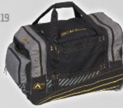
KODIAK BAG PAGE 53 • No. 3217