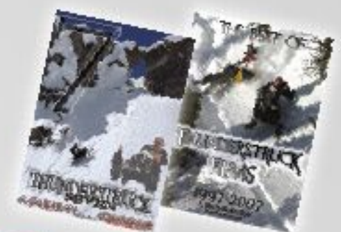
NEW THUNDERSTRUCK 7 & BEST OF PAGE 58 • No. 3004 & 3104