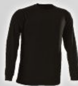
AGGRESSOR SHIRT PAGE 42 • No. 3156