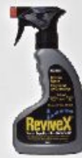
REVIVEX PAGE 58 • No. REVIVEX