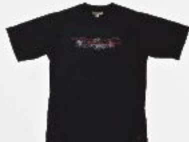
DIRT/SNOW/KLIM TECH T PAGE 55 • No. 3136